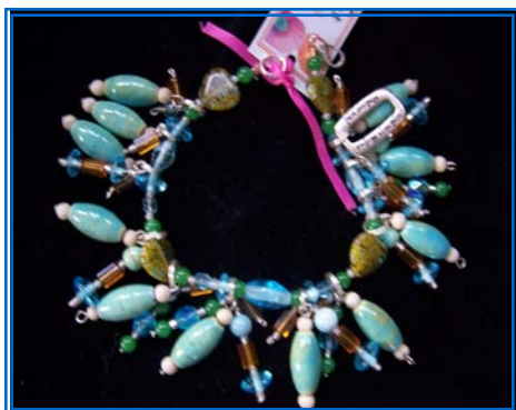
“Caribbean Sandy Ground” JTB Designer Bracelet: $30