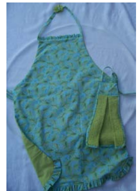
Caribbean Blue: $25 / Matching hand Towel: $5