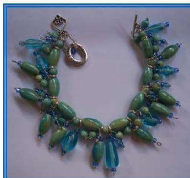
“Rendezvous Bay” JTB Designer Bracelet: $30