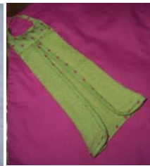
Matching Hand Towel $5 each