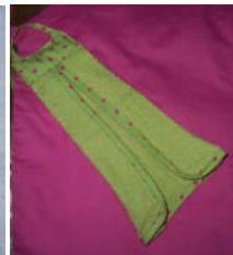
Matching Hand Towel $5 each