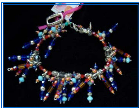
“Songs of the Caribbean” JTB Designer Bracelet: $30