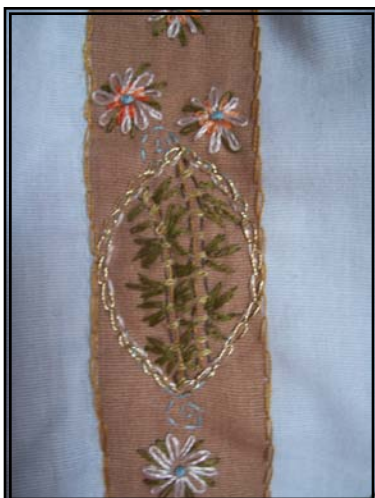
Asian theme Pillow Cases

JTB Designer Throws: $20 Comes in colors: Brown, Black, Navy