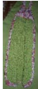
Adult Aprons are $25 each Matching hand Towels: $5 each