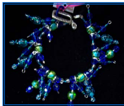
“Caribbean Blue” JTB Designer Bracelet: $30