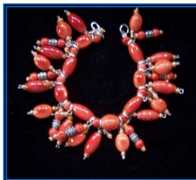
“Shine like the Caribbean Sun” JTB Designer Bracelet: $30