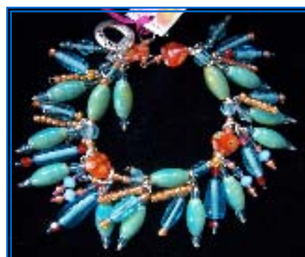
“Caribbean Trade Winds” JTB Designer Bracelet: $30