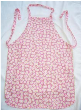
Pretty Dots in Pink Adult Apron: $25 / Children's $10 to $12